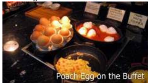
Poach Egg on the Buffet