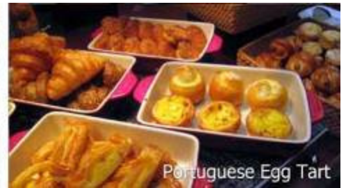
Portuguese Egg Tart