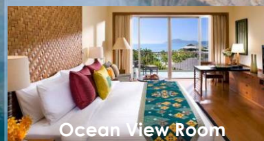
Ocean View Room