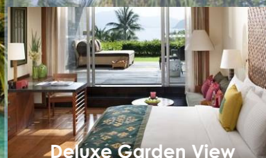
Deluxe Garden View