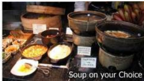
Soup on your Choice