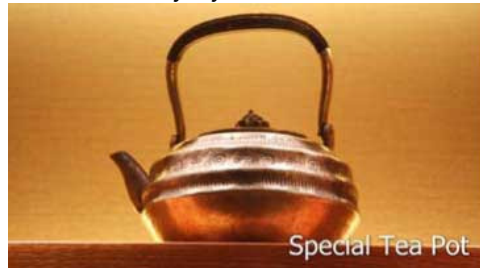
Special Tea Pot