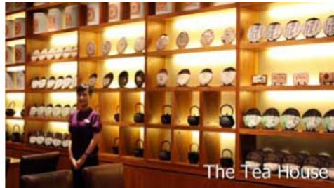
The Tea House